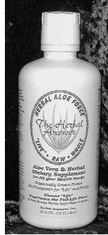
Herbal Answers Herbal Aloe Juice with Essiac Herbs.

(FeLV) is a retrovirus. Forty percent of cats are dead from the disease within four weeks of contracting it, and 70% within eight weeks.