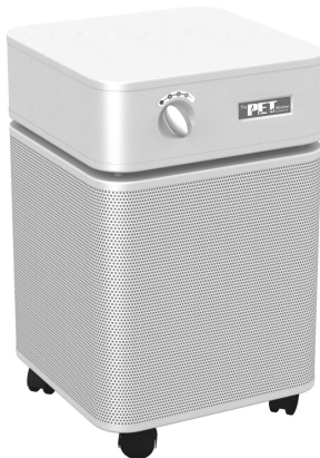
Austin Air's new Pet Machine

Is there a better way to clean the air around pets?