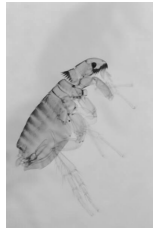
Fleas do NOT like a healthy animal.

The larvae that hatch from these eggs feed on tiny bits of dried blood (flea Dirt) that fall off when your pet grooms itself or is combed. After one to two weeks, the larvae become pupa cocoons, and a week or two later (depending on condi-